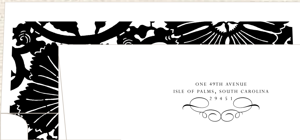
Outer Envelope with Liner

KRISTEN Invitation Suite ***** INK: Lake, Smoke, Black FONT: Standard 8, Decorative 1 PATTERN: Mandarin, Architex