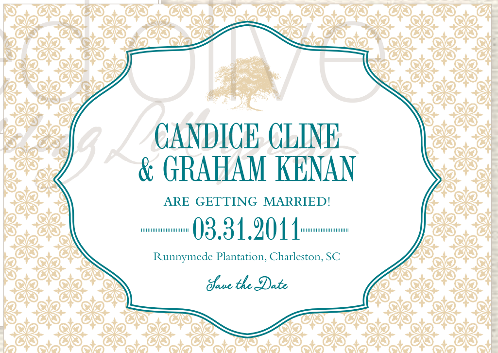
Save the Date and Envelope