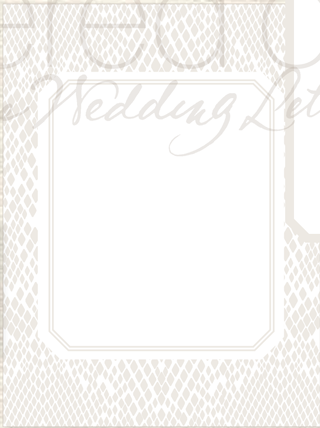
Folded Table Number